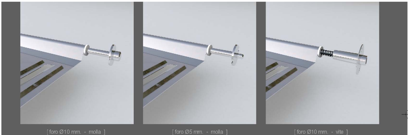
[ foro Ø10 mm. - molla ]